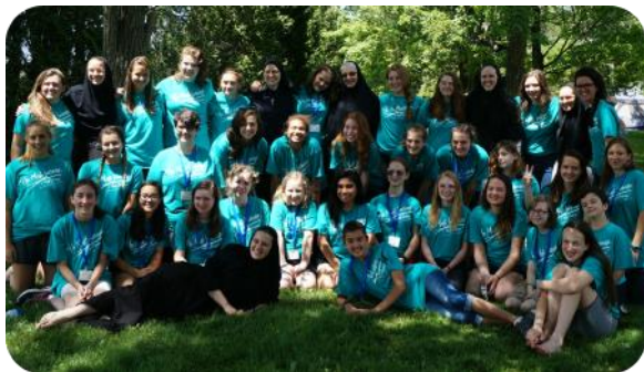
Annual Girls' Camp

Learn more about us on our website: www.christthebridegroom.org