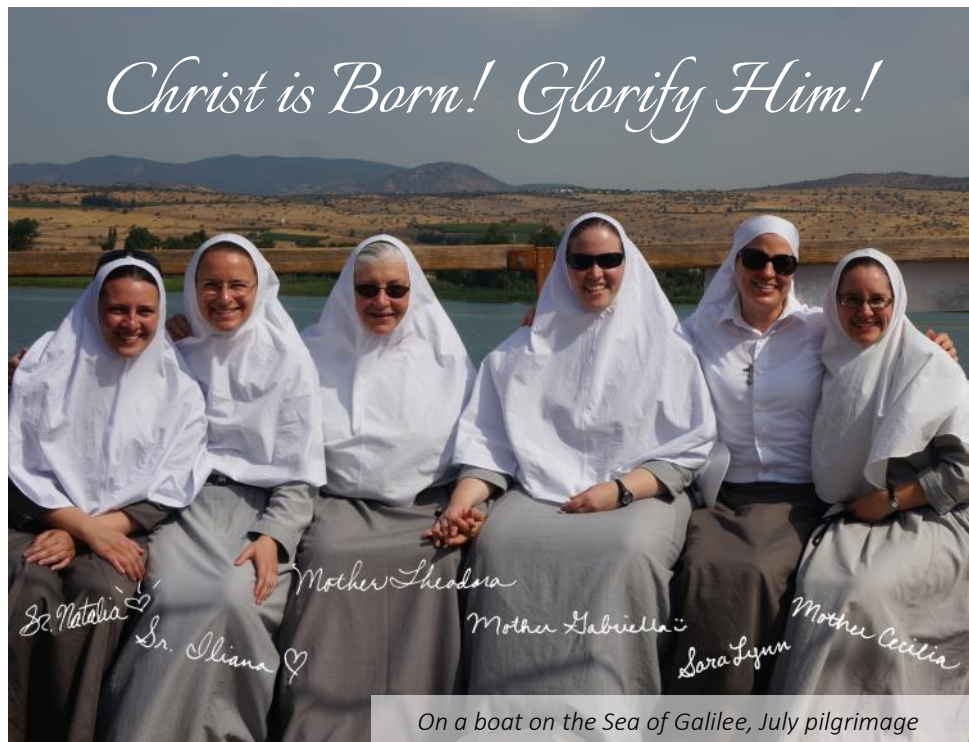
On a boat on the Sea of Galilee, July pilgrimage