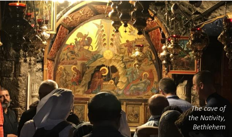
The cave of the Nativity, Bethlehem

"The King of Israel, the Lord, is in your midst; you shall fear evil no more." Zeph. 3:15